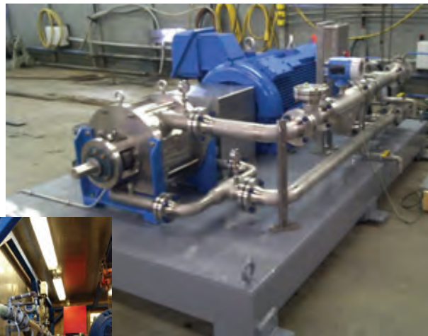
TrueMud Shear Mixer "Drop-In" Unit on a 8 by 10 Foot Skid.