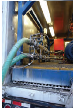
TrueMud Shear Mixer "Self-Contained" in a 20' Box on Location