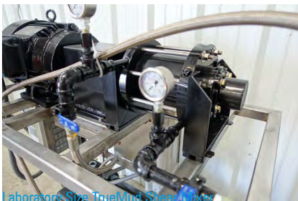
Laboratory Size TrueMud Shear Mixer

TrueMud™ Dynamic Mixing / Shearing / Heating Technology Makes Better Mud